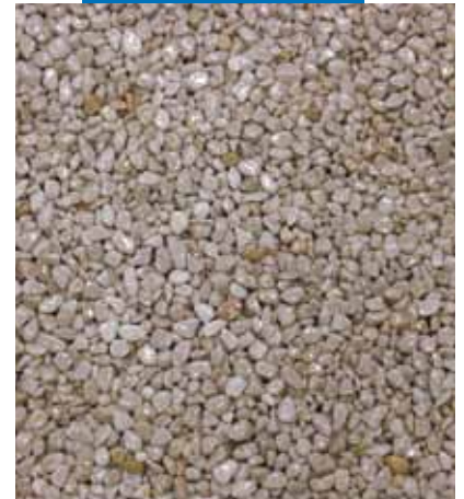
Application of the mixture of natural aggregates + Mapefloor I 910