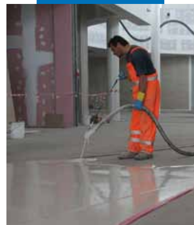
Mechanical application of Ultratop