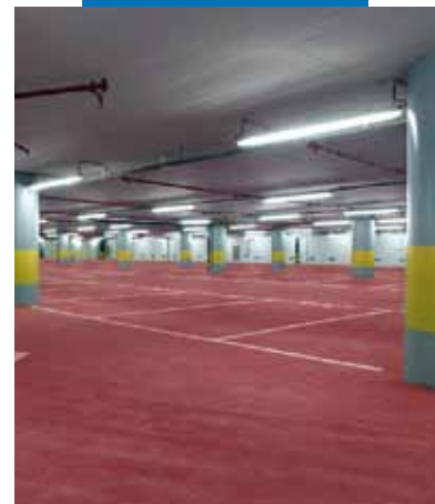
Floor made using red Ultratop in the Berlaymont Building, Brussels