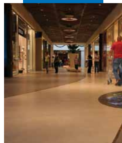
The final result of a floor made using Ultratop