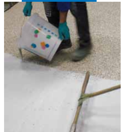
Application of Ultratop on the hardened surface of the mixture made of natural aggregates + Mapefloor 910