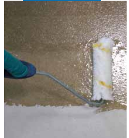
“Terrazzo alla veneziana” effect. Application of Mapefloor I 910