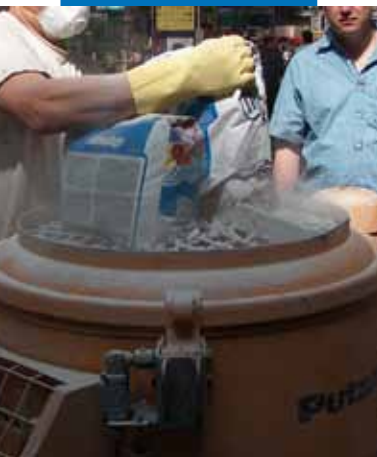
Preparation of Ultratop in a mixer