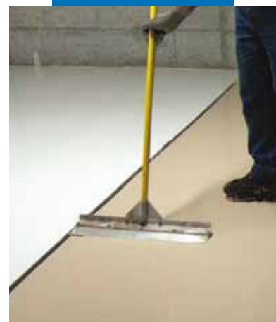
Smoothing Ultratop immediately after spreading